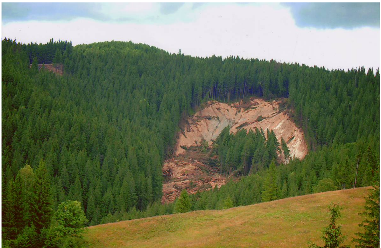
Figure 2: Shift of plastic type of 7.6 hectares (natural landmark Foshky Putyla region, Chernivtsi area, Ukraine, 2008).