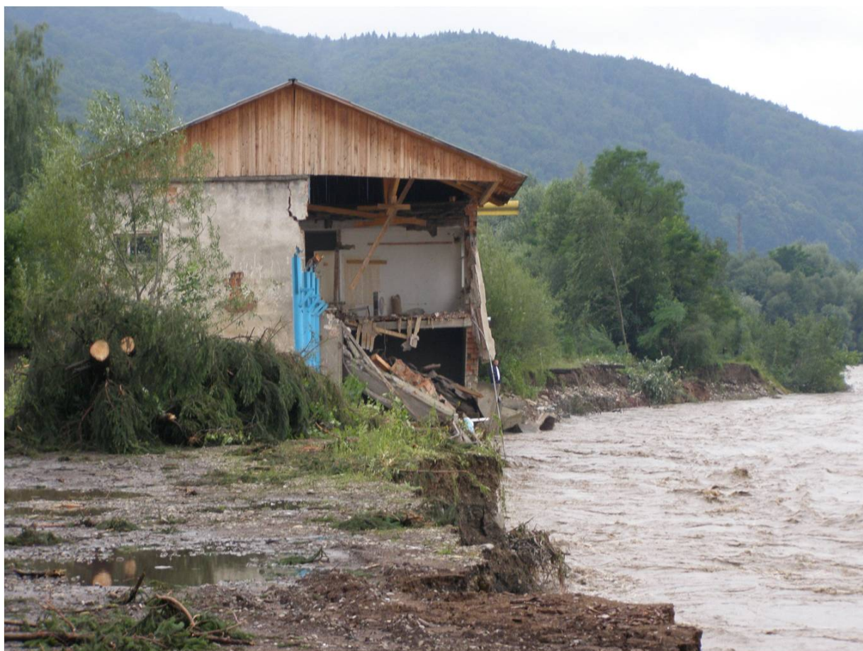
Figure 3: Result of destructive action of a flood on the river Cheremosh (Yablunytsia village, Putyla region, Chernivtsi area, 2010).

For the environmental resource problems a solution of the balance development norms according to Carpathian Convention principles is the sustainable development of the mountain and foothill region on the Chernivtsi territory.