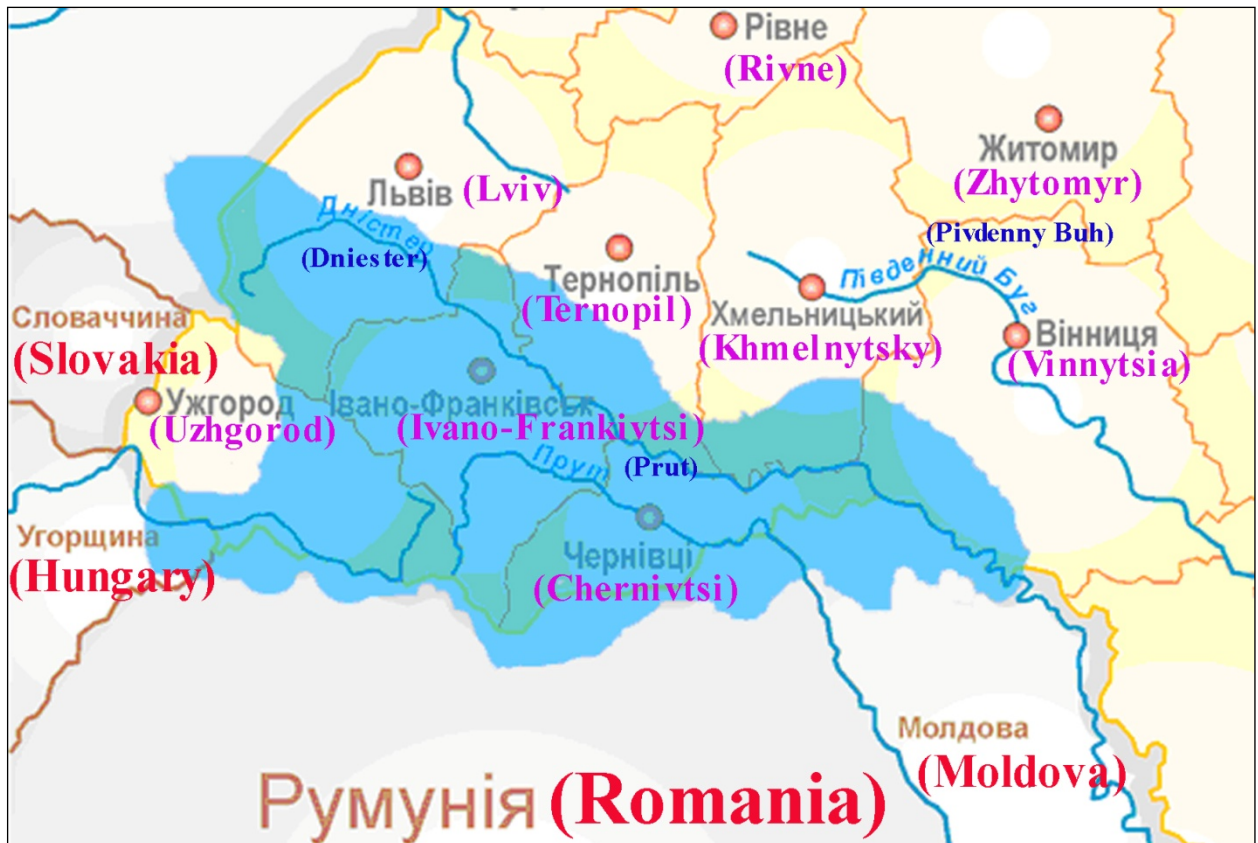
Figure 1: Schematic map of territories where catastrophic floods are shown (blue).