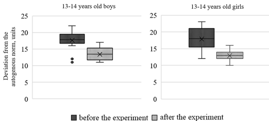
Figure. 2. The index of deviation from the autogenous norm tested in 13-14 years old boys and girls during the pedagogical experiment (p<0.001).

The total deviation from the autogenic norm can indicate the degree of emotional discomfort from a state of absolute rest. The value of the total deviation from the autogenous norm is in the range of 0 to 32, where 32 indicates the maximum tension. The obtained test results prove the Olympic education program's effectiveness on the neuropsychological stability level observed in boys and girls aged 13-14 during the pedagogical experiment (see Fig. 2).