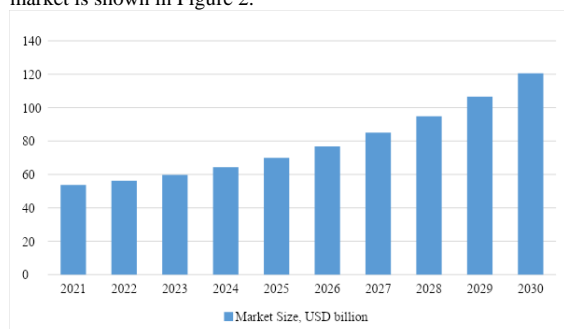
Figure 2. Language Learning Market

progress introduces innovative solutions for language learning, such as online platforms, mobile applications and virtual reality, making the learning process more efficient and exciting. Investments in educational technology are growing as educational institutions and corporations recognize the importance of cross-cultural environments in today's world. Such trends encourage foreign language teachers to adapt to new teaching methods and develop more dynamic and interactive lessons. The total volume of the foreign language learning market is shown in Figure 2.