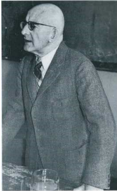
Figure 2. Academician P. S. Alexandrov