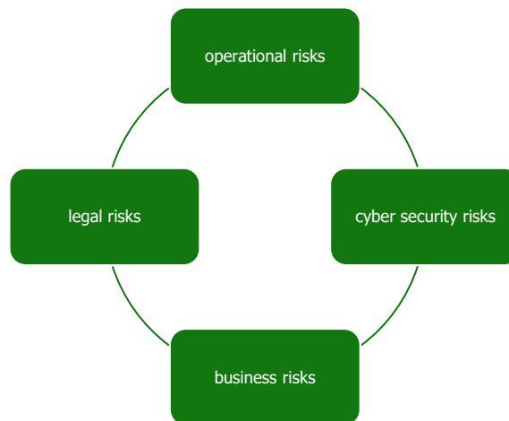
Figure 3. Key risk areas for the state to deal with in terms of the banking sector under armed aggression.

direction, depending on the available resources and the state's ability to respond to specific exogenous and endogenous general and specific factors. In particular, Ukrainian public authorities faced a number of challenges in 2022, which can be divided into several groups, namely operational risks, cyber security risks, business risks, legal risks, which are schematically presented in Figure 3.